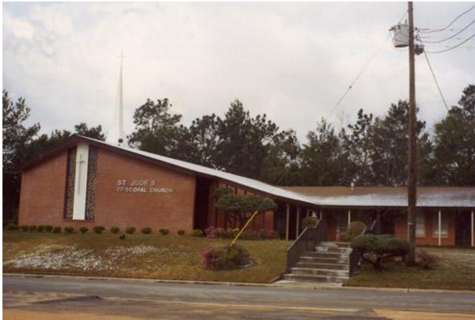
St. Jude's Valparaiso, FL 1990's