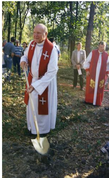
Groundbreaking St. Jude's Niceville, FL

Niceville facility was complete. The relocation to the heart of neighboring Niceville was vital to our continued growth.