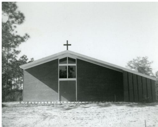
St. Jude's, Valparaiso, FL November 1960