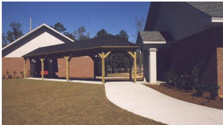
St. Jude's, Niceville, FL January 2000